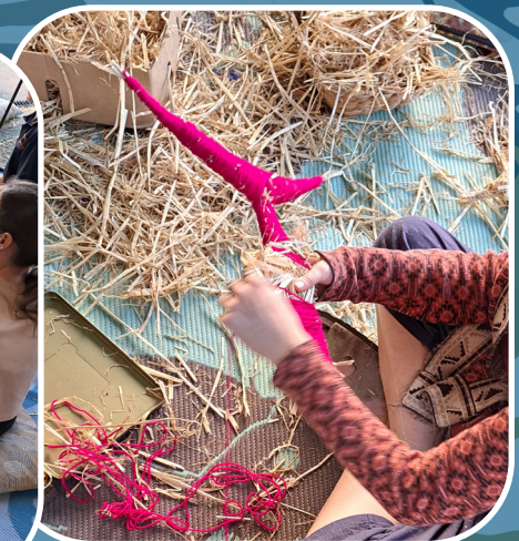
A young community member 9yrs: "can we come to community house everyday"