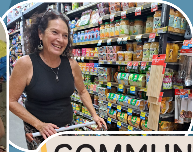
PCH Volunteer out & about to restock PCH Community Pantry.