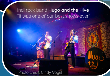
Indi rock band Hugo and the Hive "it was one of our best shows ever"